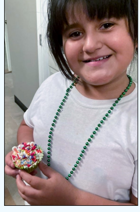
Learning to bake cupcakes with a team