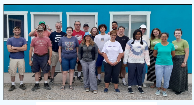
His Providence Church Swansea, MA August 2023