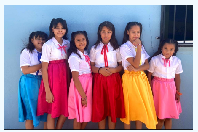
Summer VBS program