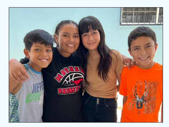
Lots of Love here!