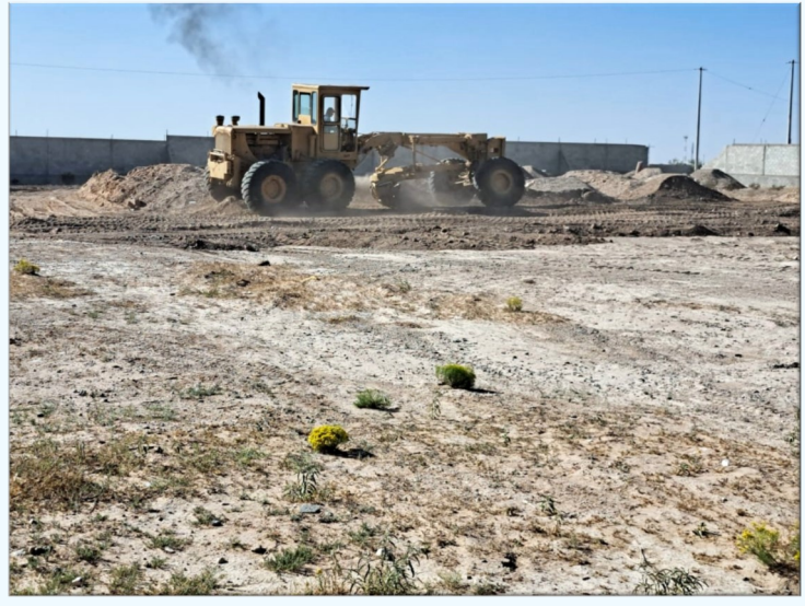
Leveling the ground for the school, Oct. 2023