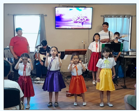
Resplandor De Vida Children's Home Summer VBS program