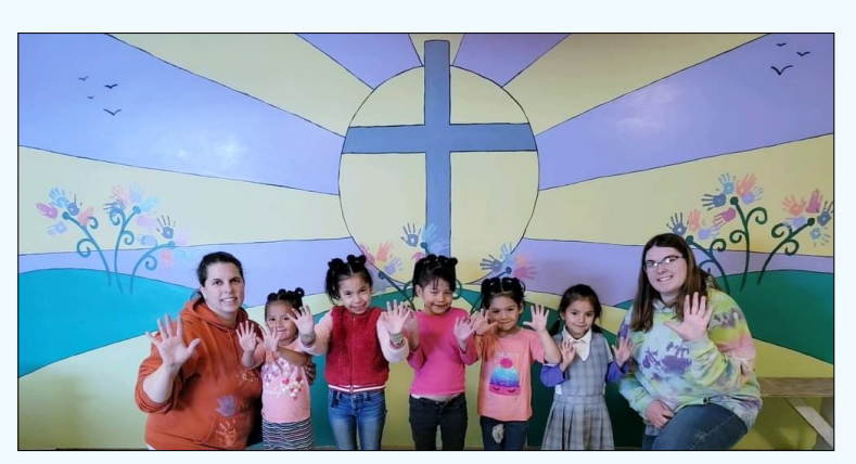
January team painted a mural with the young girls. Their handprints made the flowers.