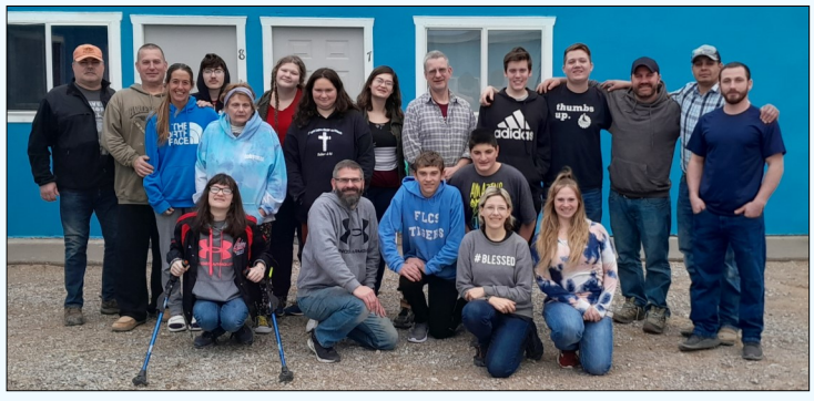
Calvary Chapel Seneca Falls & The Rock Church Seneca Falls, NY/Lakewood, NY February 2023