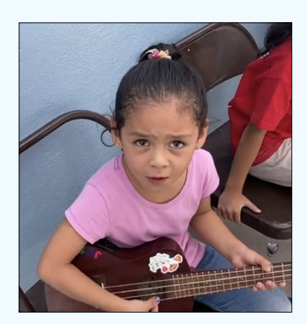
Singing 'Gloria a Dios' with all her heart on this ukulele!