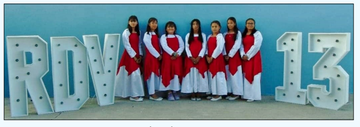
Praise dance team