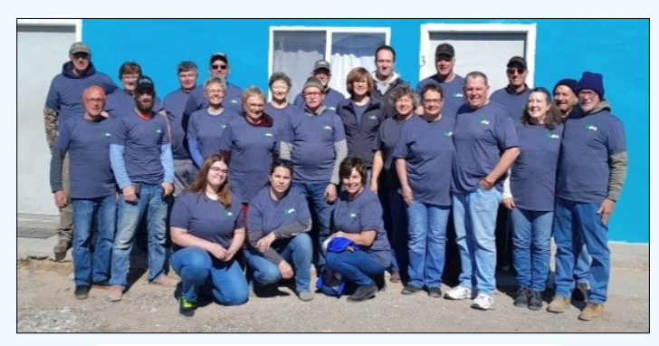
Justice For All Rock Valley, IA January 2023